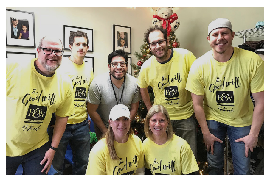
Our Home Office went to La Casa Norte to help decorate their facilities for the holidays

Everyone at Baird & Warner takes our efforts with the Good Will Network very seriously, and our local offices are a huge part of that. Every year the agents at each office concentrate their efforts to support their neighbors in their own communities. Here's a sampling of what just a few of them did to help.