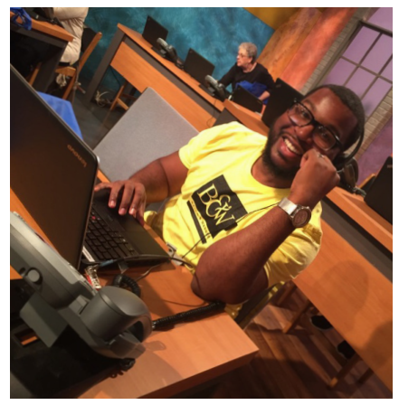
The South Loop office answered phones at the live taping of WTTW's "Cornerstones of Rock: American Garage" TV show