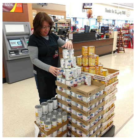
Baird & Warner Naperville teamed up with their local Jewel-Osco and Boerman Moving, Storage & Logistics for a food drive