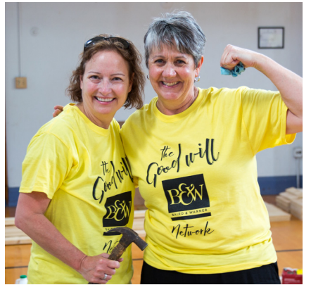
Baird & Warner agents and employees, and their families, at the 2017 Chicago Cares Serve-a-thon