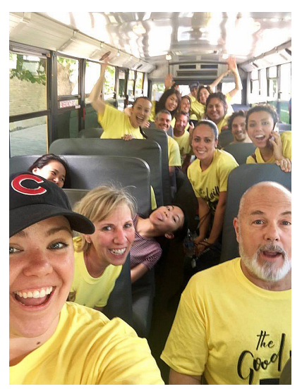
Baird & Warner agents and employees on the way to the Chicago Cares Serve-a-thon