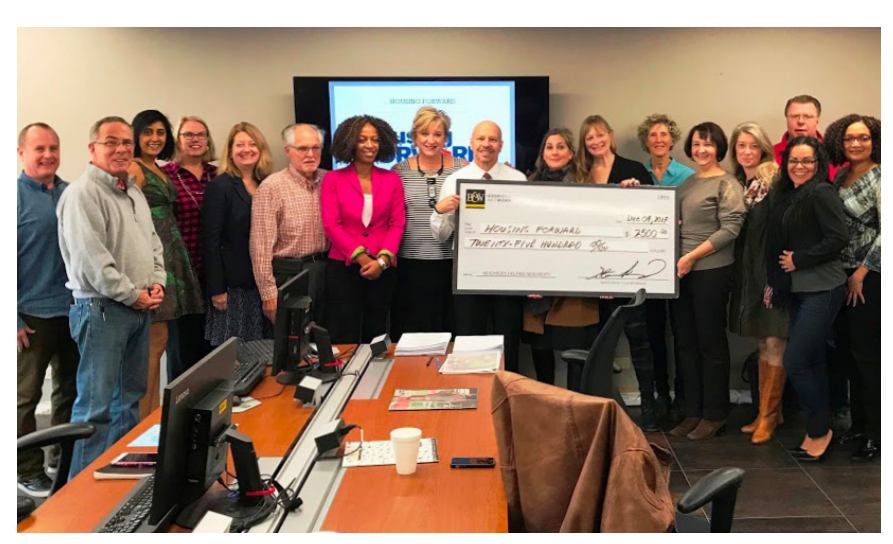
Baird & Warner Oak Park held a fundraiser for Housing Forward

Everyone at Baird & Warner takes our efforts with the Good Will Network very seriously, and our local offices are a huge part of that. Every year the agents at each office concentrate their efforts to support their neighbors in their own communities. Here's a sampling of what just a few of them did to help.