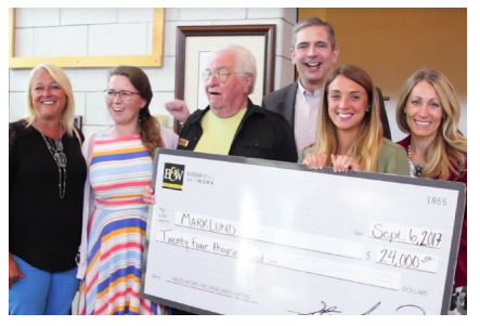
Marklund receiving their 24K of Solid Good grants